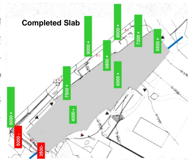
Finished with CARBOMETUM® screed over the conventional concrete slab